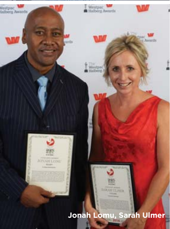
Jonah Lomu, Sarah Ulmer