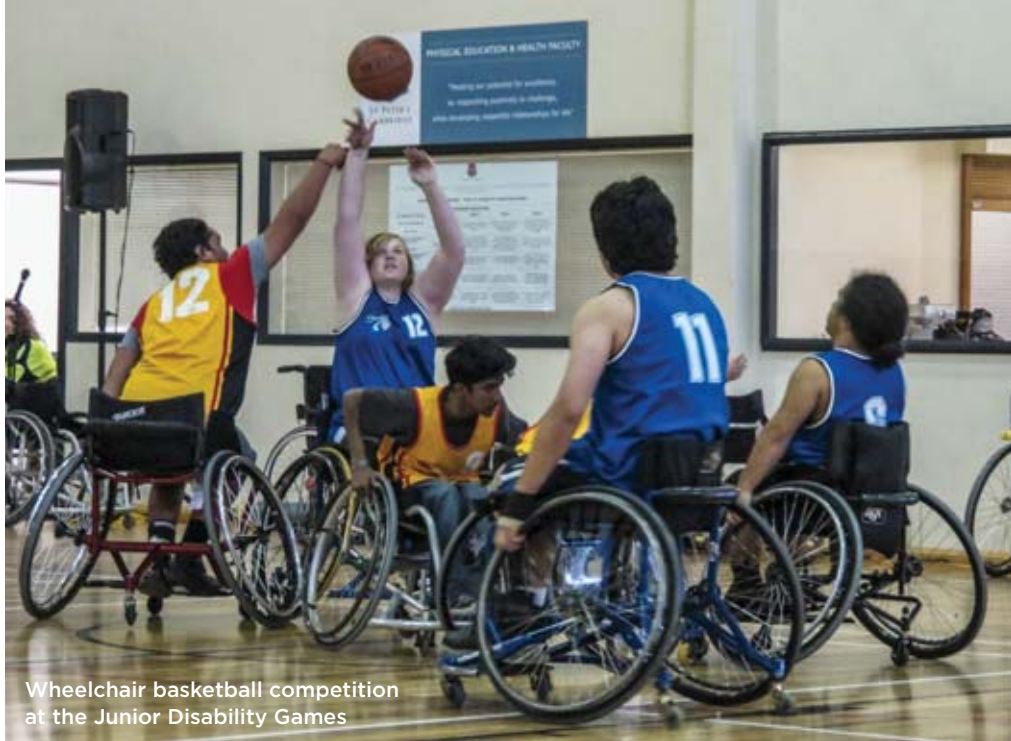
Wheelchair basketball competition at the Junior Disability Games