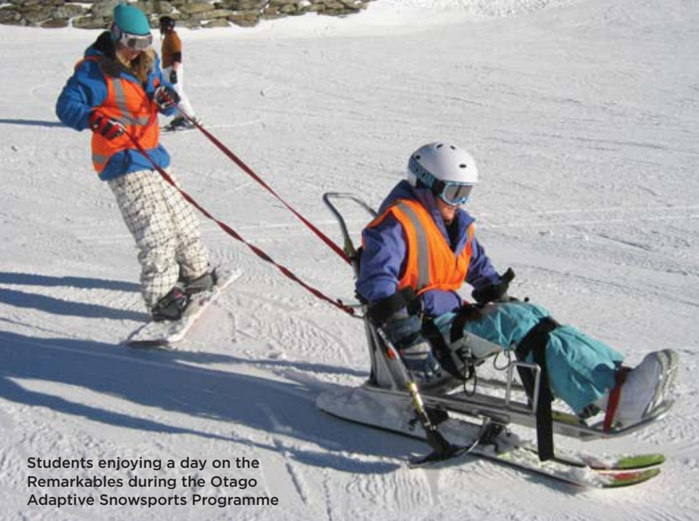
Students enjoying a day on the Remarkables during the Otago Adaptive Snowsports Programme