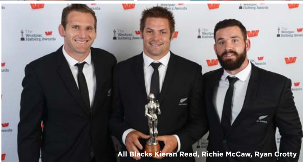
All Blacks Kieran Read, Richie McCaw, Ryan Crotty